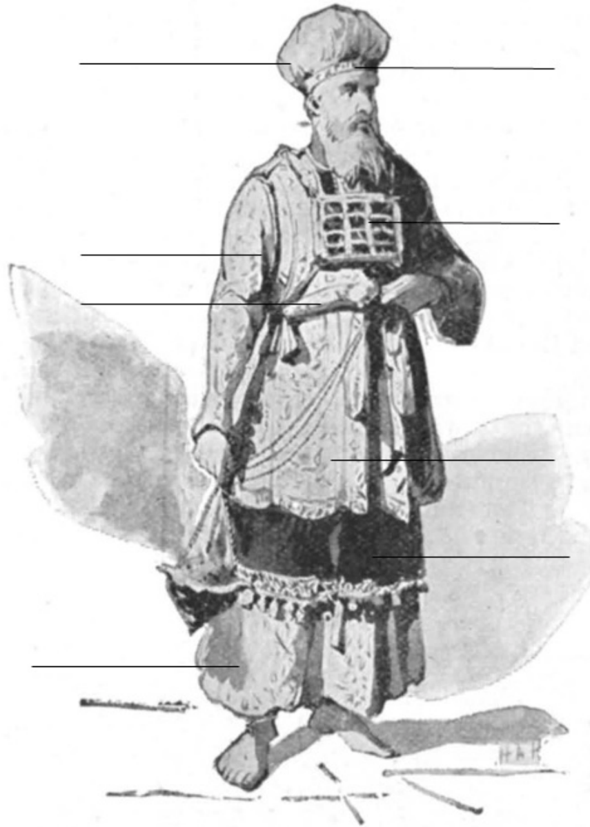
HIGH PRIEST IN ROBES AND BREASTPLATE. —Lev. viii. 8.

Can you name the parts of the Kohen Gadol's clothing?