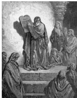
Ezra was the first to initially gather together the Men of the Great Assembly

According to the Talmud (Bava Basra 14b-15a, Rashi to Megillah 3a, 14a), much of the contents of the Tanach were compiled by the Men of the Great Assembly ("Anshei K'nesset HaGedolah") a task completed in 450 BCE, and have remained unchanged since that date. Formal closure of the canon has often been ascribed to Rabbinic Judaism in 70 CE. The twenty-four books are also mentioned in the Midrash Koheleth 12:12. A slightly different accounting can be found in the book Against Apion, by the 1st-century Jewish historian Josephus, who describes 22 sacred books. Some scholars have suggested that he considered Ruth part of Judges and Lamentations part of Jeremiah.... Other scholars suggest that at the time Josephus wrote, such books as Esther and Ecclesiastes were not yet considered canonical.