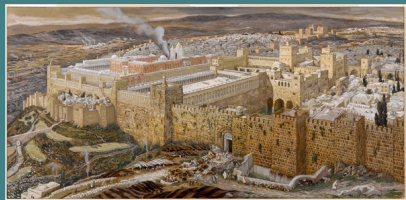
Beit HaMikdash—Holy Temple in Jerusalem

This site offers information about Conversion to Judaism, the Basics of Judaism, Jewish Texts, Jewish Law, Religious Life, Jewish Life, Jewish History, Israel, Righteous Gentiles, and References (including Recommended Readings and Additional Links). My goal is to make available a wide variety of plain, basic information about Judaism, written from a traditional perspective.