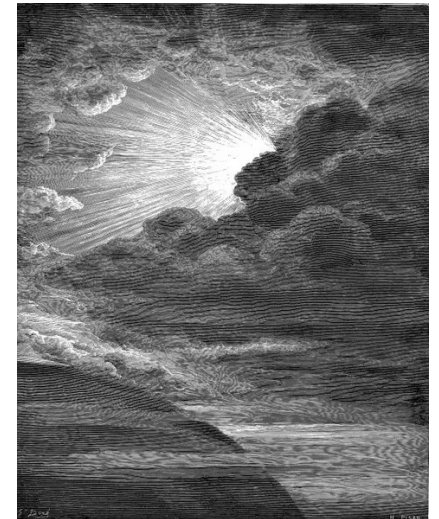
Creation of Light on the first day